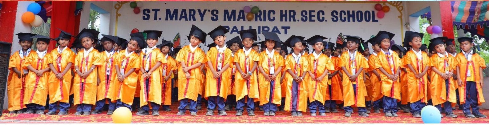
The KG Graduation Ceremony was held on 21 st February 2026, marking a joyful milestone for our young learners. The event celebrated their successful completion of Kindergarten and their readiness to step into primary education, making it a proud and memorable occasion for students, parents and teachers